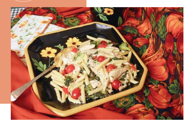
Napkins and dinnerware pictured above come from Hartford Hospital's Auxiliary Gift Shop.